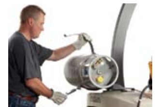
▲ STEP TWO: Unlatch clamp to remove bottle.

THE BOTTOM LINE: Easier on your back, no reaching up, better visibility and a simpler process.