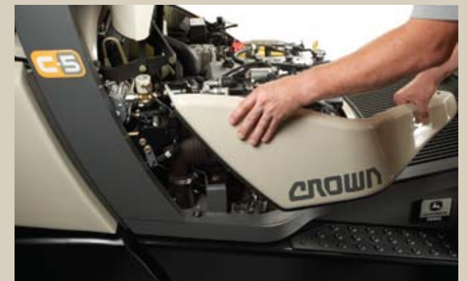
▲ SIDE PANEL REMOVAL: The C-5 features removable side panels for top and side access to engine and components. No tools required.