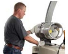
▲ STEP ONE: Pull pin to enable the tank to fold back.

The LP bracket was designed to make bottle removal easier. It also simplifies access to the engine compartment for service and maintenance.